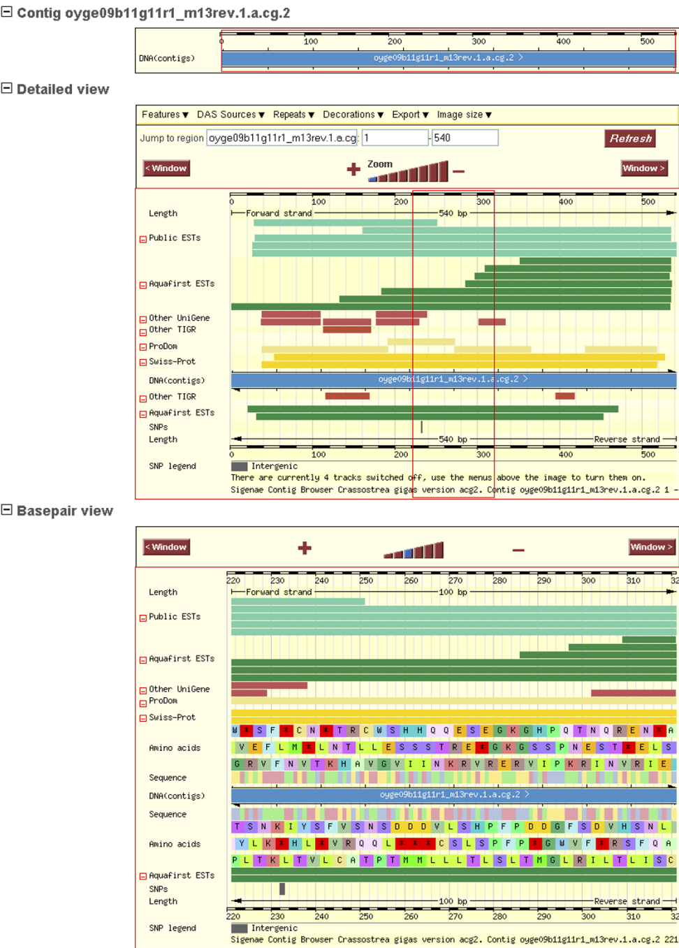
Figure 2 Graphical view of the contig by "ContigView" available in GigasDatabase. The ContigView screen gives a graphical overview of the contig structure. Each sequence is represented as a line, and colors indicate the type of sequence. The first level corresponds to the sequence fragment overview. The second level is the detailed view of the individual sequences belonging to the contig. The red frame represents the visualized section on the third level. The third level is the base-pair view of the DNA contigs.