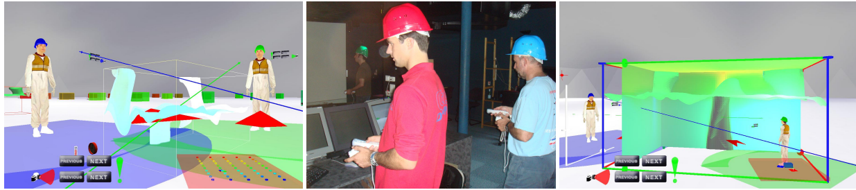
Figure 1: Data sets dispatched all around a CVE - Three users collaborating within a CVE - Merged data sets in a CVE

Laurent Aguerreche§ IRISA – INSA de Rennes