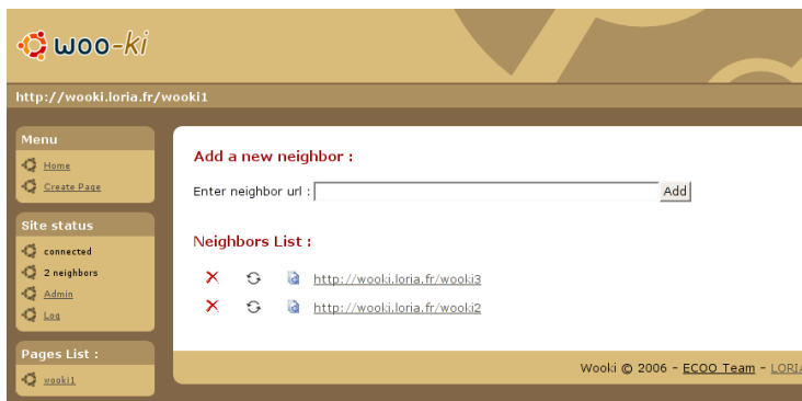
Fig. 4. Wooki Neighbors