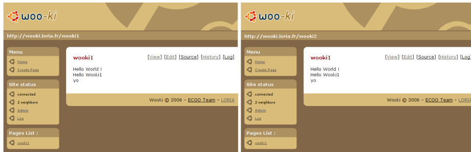
Fig. 3. Wooki Interface