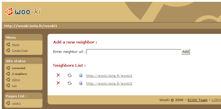
Fig. 4. Wooki Neighbors