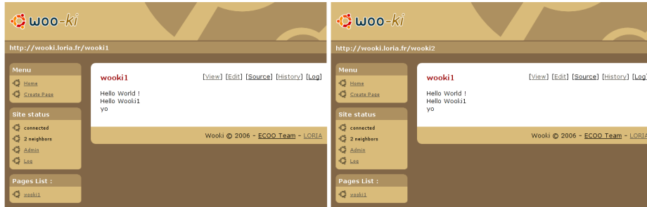
Fig. 3. Wooki Interface