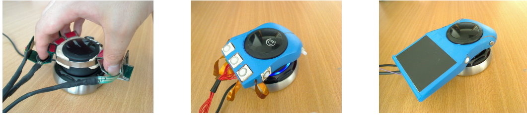
Figure 1: From left to right: the V2 prototype with petals and force sensors, the V3c prototype with trackballs and the V3b prototype with a touchpad and trackballs.

between the force the user applies to move the fingers and the one the user applies on the SpaceNavigator to move the hand. Thus, the shape of the device and sensor's technologies, especially their mechanical properties, are important elements to be considered.