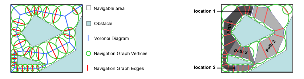
Fig. 1. Left Image: 2-D representation of a Navigation Graph. Right Image: Result of a Navigation Flow query: 3 Navigation Paths are found, each being a sequence of gates delimiting a corridor joining the 2 locations given as input of the query

Navigation Graphs (\mathcal{NG}) is a graph structure capturing the topology and the geometry of the navigable space of a given environment. Navigable space is the flat part of an environment (flat enough to allow human walk, according to a user-defined threshold slope) free of any obstacle.