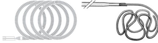
Fig. 1. Example of coils used in our simulations, left: Boston Scientific helical coil GDC 10, right: 3D GDC built with omega loops [13]

for the stick and slip transitions that take place during the deployment of the coil. The model also includes a compliant behavior of vessel wall that is close to Boussinesq model [14]. For modeling contacts with friction, we use two different laws, that are based on the contact force and on the relative motion between the coil and the aneurysm wall. The contact law is defined along the normal \mathbf{n} and the friction law, along the tangential (\mathbf{t}, \mathbf{s}) space of the contact.