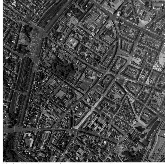
Fig.2 – Right image of an urban scene calibrated stereo pair © French Geographic Institute (IGN).

of the disparity map is not large, we can avoid considering the epipolar geometry. Using epipolar lines does not increase the accuracy but can slow down seriously the computations.