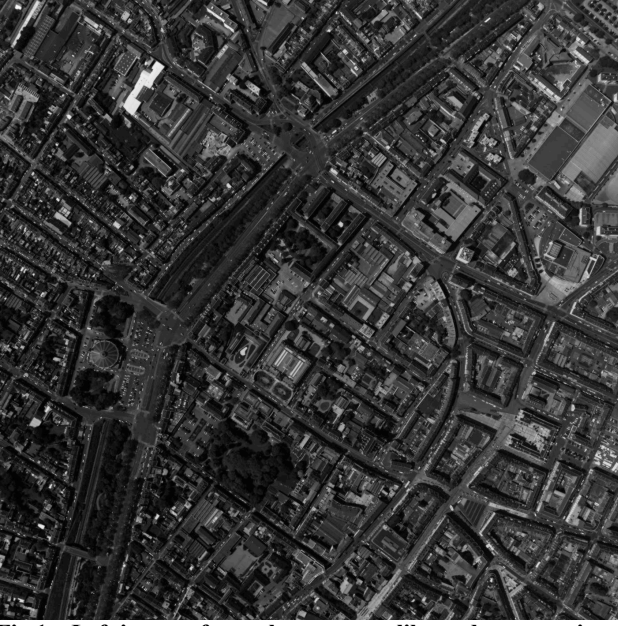
Fig.1 – Left image of an urban scene calibrated stereo pair © French Geographic Institute (IGN).