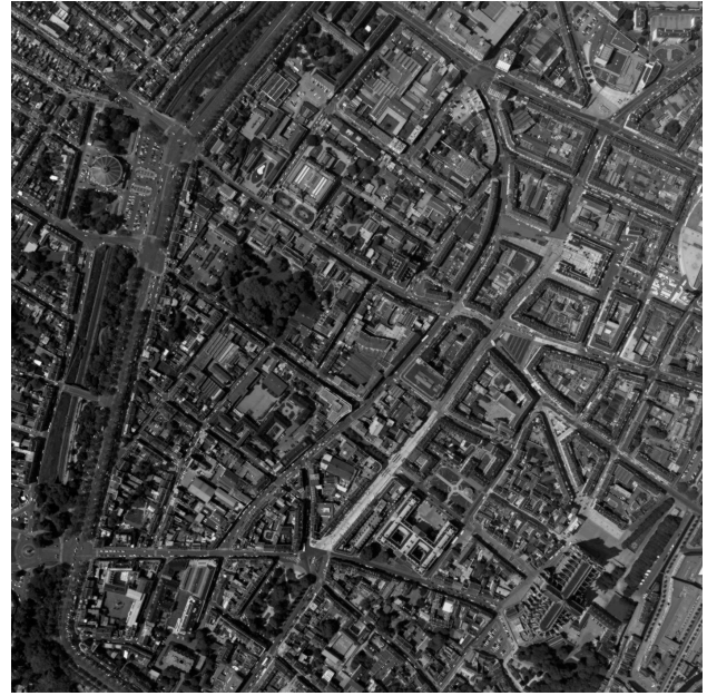
Fig.2 – Right image of an urban scene calibrated stereo pair © French Geographic Institute (IGN).

of the disparity map is not large, we can avoid considering the epipolar geometry. Using epipolar lines does not increase the accuracy but can slow down seriously the computations.