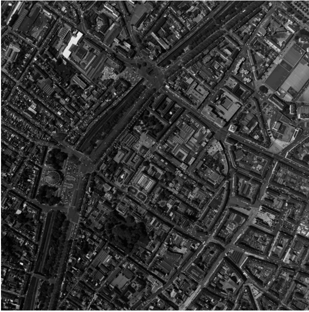
Fig.1 – Left image of an urban scene calibrated stereo pair © French Geographic Institute (IGN).