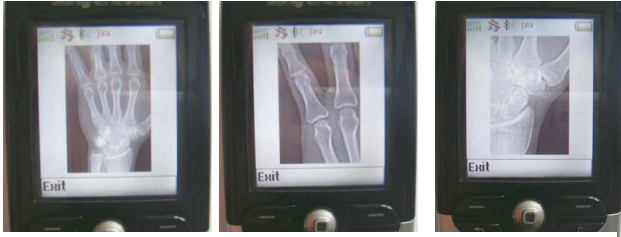
Figure 3. Hierarchical navigation within regions.