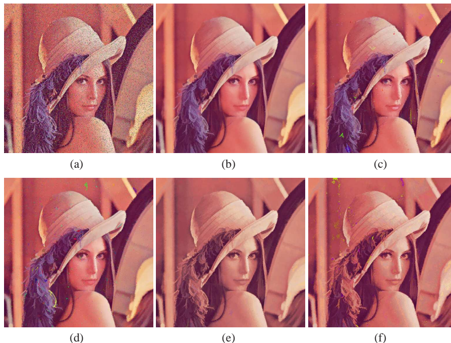
Fig. 2. Comparison of filtering operators \Psi based on area opening using different processing strategies. (a) Lenna image corrupted by 15% random noise. (b) Marginal processing ( M ). (c) Lexicographic ordering ( L ). (d) Distance-based total ordering ( dL ). (e) Preordering ( P_{mean} ). (f) Preordering ( P_{median} ).