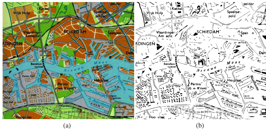
Fig. 3. Binarisation method of colour documents. (a) Original colour document, (b) Binarisation method based on a processing strategy involving two distance-based reduced orderings ( dL ) aiming at extracting black and dark blue characters.

The reduced ordering based on multiple reference vector provided interesting results, since it enabled to highlight the objects of interest w.r.t. the background. However it was not appropriate in this application: for example, in Fig. 3(a), the letter “G” in black in the image upper left became connected to the river in blue, therefore preventing the correct extraction of this component. The best result was obtained by using multiple distance-based reduced ordering, each aiming at extracting characters of a given colour and by taking the supremum of the results (see Fig. 3).