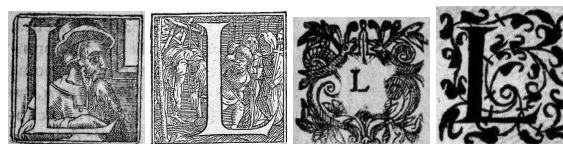
Figure 2: Drop cap samples of a subset of the OLDB (Ornamentals Letters DataBase) database.

The Madonne database OLDB (Ornamentals Letters DataBase) consists of graphical decorative initials extracted from archival documents 1 . This corpus is part of a study performed by French research teams 2 on historical documents. The database is composed of more than 6000 drop caps. To conduct our experiments, we have selected from this database a subset of 200 images representing 20 different uppercases. The test set has been constructed to be representative of the various styles of drop caps (see examples on Figure 2). Drop cap images are grey-scale, composed of the letter (uppercase) part and texture part. Size of images is between 150 \times 150 and 750 \times 750 . Due to the digitalization process, the letter is approximately centered and vertical. Drop cap images are noisy and contain artifacts such as superimposed text, coming from following book pages.