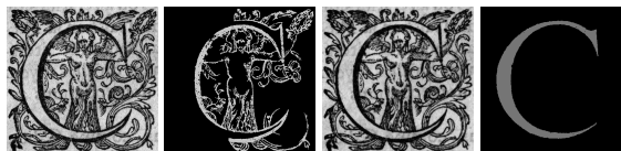
Figure 3: a) Original drop cap image, b) Segmentation of (a) (letter recognized as "S"), c) Opened image (the uppercase is disconnected from the background), d) Segmentation of (c) (letter properly recognized).

In the tree based methods, morphological opening allowed to disconnect the uppercase from texture parts as illustrated on figure 3, therefore increasing the recognition rate.