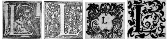
Figure 2: Drop cap samples of a subset of the OLDB (Ornamentals Letters DataBase) database.

The Madonna database OLDB (Ornamentals Letters DataBase) consists of graphical decorative initials extracted from archival documents 1 . This corpus is part of a study performed by French research teams 2 on historical documents. The database is composed of more than 6000 drop caps. To conduct our experiments, we have selected from this database a subset of 200 images representing 20 different uppercases. The test set has been constructed to be representative of the various styles of drop caps (see examples on Figure 2). Drop cap images are grey-scale, composed of the letter (uppercase) part and texture part. Size of images is between 150 \times 150 and 750 \times 750 . Due to the digitalization process, the letter is approximately centered and vertical. Drop cap images are noisy and contain artifacts such as superimposed text, coming from following book pages.