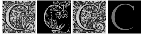
Figure 3: a) Original drop cap image, b) Segmentation of (a) (letter recognized as "S"), c) Opened image (the uppercase is disconnected from the background), d) Segmentation of (c) (letter properly recognized).

In the tree based methods, morphological opening allowed to disconnect the uppercase from texture parts as illustrated on figure 3, therefore increasing the recognition rate.