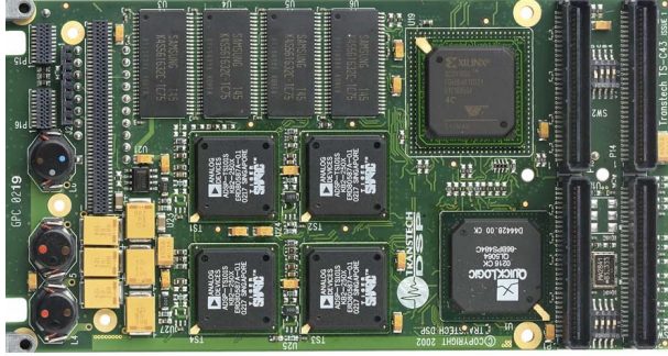
Fig. 2. The TS-C43 PMC board

The numerical processing is computed using two TS-C43 PMC from VSystems [12]. Each board (fig. 2) comprises 4 clustered TigerSHARC DSP allowing a 300 MHz processing, a Xilinx Virtex-II FPGA and a 528 Mo/s PCI connection.