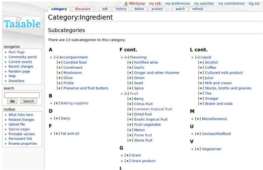
Fig. 2. WIKITAAABLE ingredient ontology.