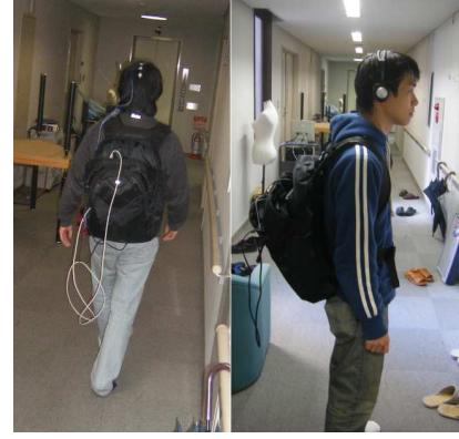
Figure 1: Subjects performing the experiment: Left: walking condition, Right: standing condition.

During the experiment, subjects could hear two brief sounds (the auditory stimuli), in the headphones, appearing in a random order. A sound was generated every 1s. One of the two auditory stimuli, the so-called target stimulus, was