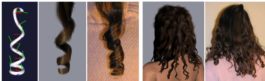
Figure 1: Virtual versus real hair ringlets