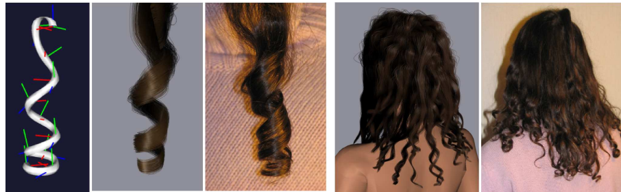
Figure 1: Virtual versus real hair ringlets