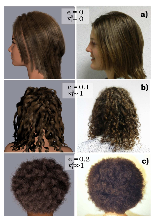
Figure 3: Right: real pictures of (a) smooth, (b) curly and (c) African hair. Left: corresponding synthetic results, generated with adequate values for e and \kappa_i^0 . Each synthetic hairstyle was created in less than half an hour.

Figure 1 and 3 show various hairstyles obtained with our method for different hair types and haircuts. Please also visit our website and watch our videos at http://www-evasion.imag.fr/Publications/2005/BAQLLC05/. Note that our method is able to capture realistic natural hair shapes.