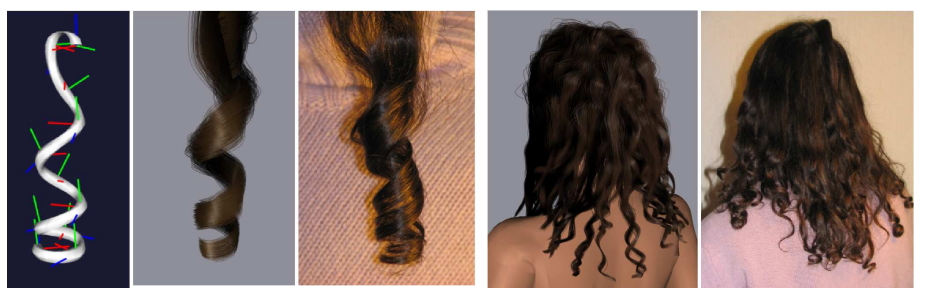
Figure 1: Virtual versus real hair ringlets