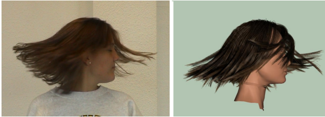
Figure 8: Comparison between a real full head of hair and our model, on a head shaking motion (straight and clumpy hair type).

and our video). Finally, Figure 8 demonstrates that our model convincingly captures the complex effects occurring in a full head of hair submitted to a high speed shaking motion.