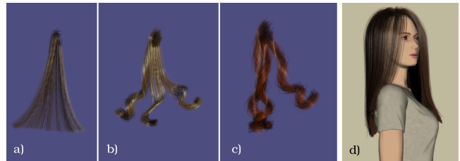
Figure 4: Semi-interpolating scheme for generating the final hair geometry: hair a) is smoothly interpolated, b) is interpolated near the roots but clumpy near the tips, c) forms disjoint locks (no interpolation); d) interpolation across the right shoulder is prevented by the criterion on the maximal distance between the tips.

Generating the rendered hair geometry: To be able to handle both smooth and clumpy hairstyles, we avoid choosing between continuum and wisp-based representations for hair. Many real hairstyles display an intermediate behavior with hair strands being more evenly spaced near the scalp than near the tips. Our solution is based on a semi-interpolating scheme to generate non-simulated hair strands from the guide strands (see Figure 4, and the video): we range from full interpolation to generate the extra hair strands near the scalp to no interpolation within a hair wisp near the tips. The separation strongly depends on the level of curliness: straight hair requires more interpolation than curly and clumpy hair. Note that for smooth, interpolated hair, we avoid interpolation between two guide strands having close roots but distant tips by adding a criterion on the distance between tips, see Figure 4, (d).