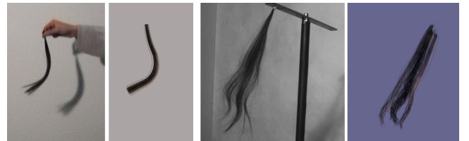
Figure 7: Left, buckling effect caused by vertical oscillations of a hair clump. Right, hair-hair interactions during fast motion.

Hair clumps: With simulation we have reproduced a series of real experiments on smooth and wavy hair clumps to show that our model captures the main dynamic features of natural hair. We used the technique presented previously to fit the parameters of the Super Helix from the real manipulated hair clump. As shown in Figure 7,