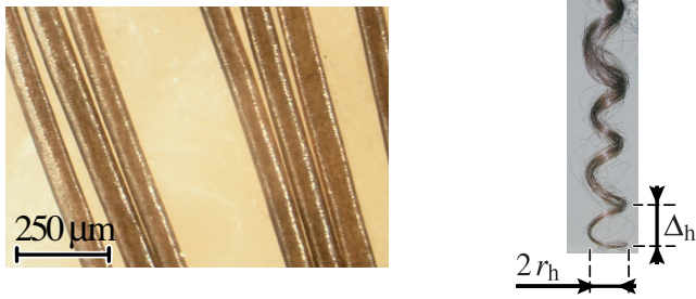
Figure 5: Left, measuring the mean radius r and the ellipticity e of the model by observation of real hair fibers with a video-microscope. Right, measuring the radius r_h and the step \Delta_h of the natural helical shape at the tip of a real hair clump.

where r_h is the radius and \Delta_h the step of the approximate helical shape of the real hair clump, measured near the tips (see Figure 5, right). Indeed, the actual curvatures and twist should be equal to their natural value at the free end of the rod, where the role of gravity becomes negligible. In practice, we add small random variations to these values along each Super-Helix to get more natural results. We have noted that in reality, most hair types have an almost zero natural twist \tau^n , except African hair (see Appendix B).