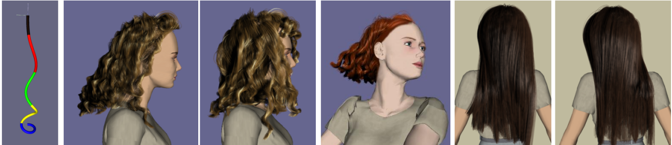
Figure 1: Left, a Super-Helix. Middle and right, dynamic simulation of natural hair of various types: wavy, curly, straight. These hairstyles were animated using N = 5 helical elements per guide strand.

Jean-Luc Lévêque L'Oréal Recherche France