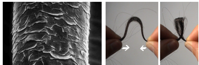
Figure 2: Left, close view of a hair fiber (root upwards) showing the cuticle covered by overlapping scales. Right, bending and twisting instabilities observed when compressing a small wisp.

Deformations of a hair strand involve rotations that are not infinitely small and so can only be described by nonlinear equations [Audoly and Pomeau 2006]. Physical effects arising from these nonlinearities include instabilities called buckling . For example, when a thin hair wisp is held between two hands that are brought closer to each other (see Figure 2, right), it reacts by bending in a direction perpendicular to the applied compression. If the hands are brought even closer, a second instability occurs and the wisp suddenly starts to coil (the bending deformation is converted into twist).