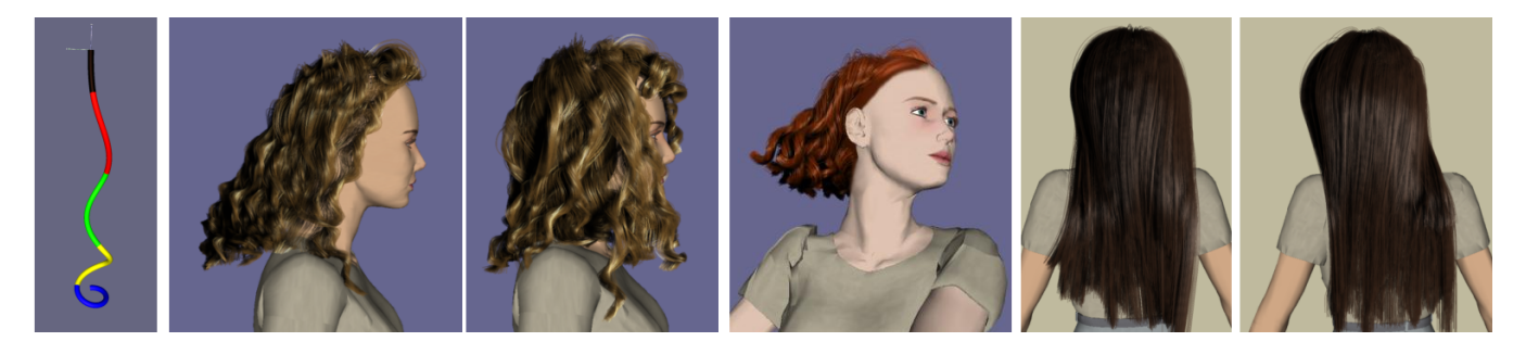
Figure 1: Left, a Super-Helix. Middle and right, dynamic simulation of natural hair of various types: wavy, curly, straight. These hairstyles were animated using N = 5 helical elements per guide strand.

Jean-Luc Lévêque L'Oréal Recherche France