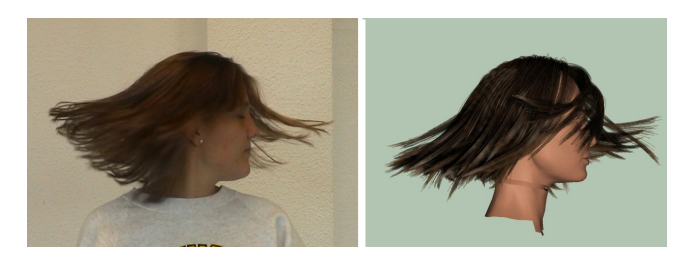
Figure 8: Comparison between a real full head of hair and our model, on a head shaking motion (straight and clumpy hair type).

and our video). Finally, Figure 8 demonstrates that our model convincingly captures the complex effects occurring in a full head of hair submitted to a high speed shaking motion.