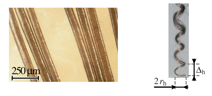
Figure 5: Left, measuring the mean radius r and the ellipticity e of the model by observation of real hair fibers with a videomicroscope. Right, measuring the radius r_{\rm h} and the step \Delta_{\rm h} of the natural helical shape at the tip of a real hair clump.

where r_h is the radius and \Delta_h the step of the approximate helical shape of the real hair clump, measured near the tips (see Figure 5, right). Indeed, the actual curvatures and twist should be equal to their natural value at the free end of the rod, where the role of gravity becomes negligible. In practice, we add small random variations to these values along each Super-Helix to get more natural results. We have noted that in reality, most hair types have an almost zero natural twist \tau^n , except African hair (see Appendix B).