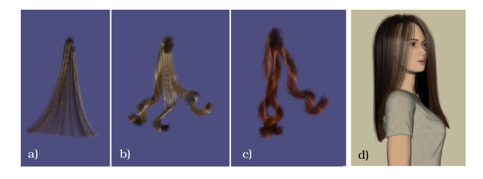
Figure 4: Semi-interpolating scheme for generating the final hair geometry: hair a) is smoothly interpolated, b) is interpolated near the roots but clumpy near the tips, c) forms disjoint locks (no interpolation); d) interpolation across the right shoulder is prevented by the criterion on the maximal distance between the tips.

Generating the rendered hair geometry: To be able to handle both smooth and clumpy hairstyles, we avoid choosing between continuum and wisp-based representations for hair. Many real hairstyles display an intermediate behavior with hair strands being more evenly spaced near the scalp than near the tips. Our solution is based on a semi-interpolating scheme to generate non-simulated hair strands from the guide strands (see Figure 4, and the video): we range from full interpolation to generate the extra hair strands near the scalp to no interpolation within a hair wisp near the tips. The separation strongly depends on the level of curliness: straight hair requires more interpolated hair, we avoid interpolation between two guide strands having close roots but distant tips by adding a criterion on the distance between tips, see Figure 4, (d).