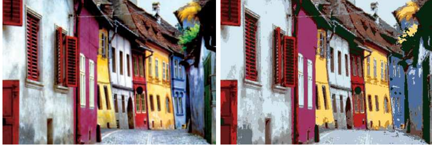
Figure 3: Distance-based mean-shift followed by k -Means clustering on the point cloud made of LUV colors of the pixels of the picture on the right.