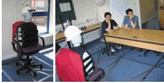
Fig. 1. Equipment setup for data recording

opportunity to efficiently use the EM algorithm to estimate the 3D positions. We note here that our model is defined so as to perform well in the single speaker case as well as in the multiple speakers case without any special reformulation. To obtain the speaking state of a person we use the posterior probabilities of the assignment variables calculated at the E step of the algorithm.