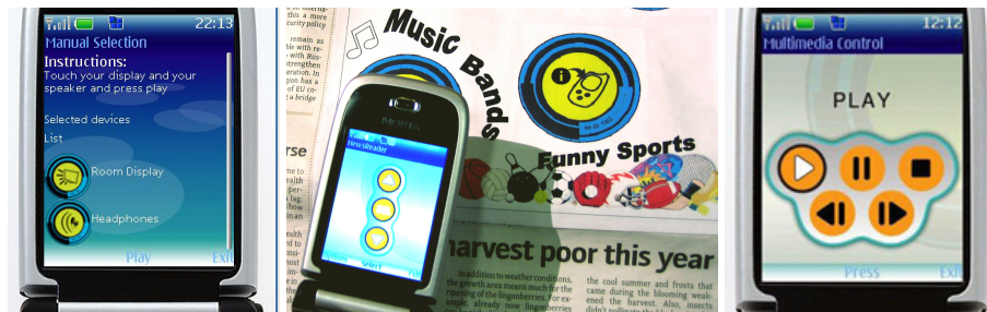
Fig. 2. The manual method's GUI (left), the newspaper (middle) and the controller's GUI (right) used with the application.

The collection of content is initiated when the user touches RFID tags in the newspaper (shown in Figure 2, middle). The information from the tags is communicated to CADEAU, that is running on a server, via the HTTP requests/responses sent over GPRS. Content browsing is based on a Web browser and Javascripts which are controlled with the mobile phone via HTTP/GPRS protocol. The mobile phone's UI is implemented using Java MIDlets. The content delivery and the playback are based on two flash players, the JWMediaPlayer and the JWImageIterator (available from www.joerenwijering.com ).