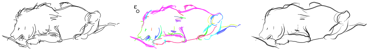
Figure 1: Lines of the initial drawing (left) are first automatically clustered into groups that can be merged at a scale \epsilon (middle). A new line is then generated for each group in an application-dependent style (at right, line thickness indicates the mean thickness of the cluster).