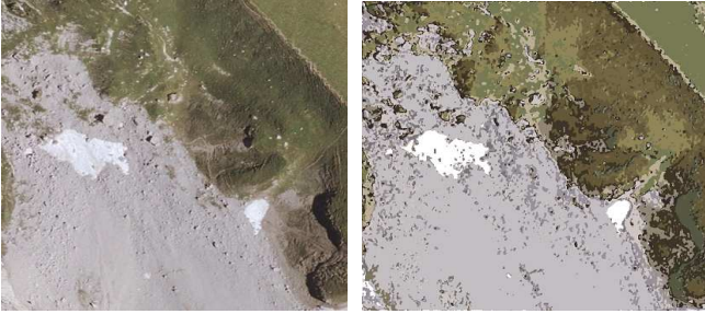
Fig. 2 Aerial image mapping using two layered HMM model: original aerial image (left) and mapping results (right). With the permission of "Régie de Données des Pays de Savoie RGD73-74" [17]

For our experiments, we used real world aerial pictures of a relatively large area, with a resolution of 50 centimeters. Our results were then used to generate reconstituted pictures like depicted in figure 2. This showed that our classifier was able to satisfactorily reproduce the original images.