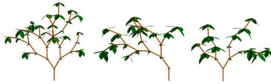
FIG. 3 – Occurrences of the Leeuwenberg model with rest probabilities