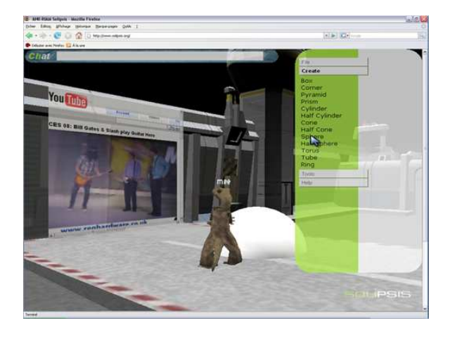
Figure 3: Web based navigator embedding modeling tools, and providing a mapping of web pages as interactive textures.

3D rendering engine. Its robustness, efficiency, upgradability and openness are, in fact, essential features for a durable system. Moreover, Ogre 3D can be easily embedded in web pages thanks to a Mozilla or ActiveX plugin. Conversely, web pages can be mapped on 3D models as interactive textures thanks to the Navi library based on Gecko. Thus, the navigator allows a Web 2.0 navigation inside the Web 3D, as well as a Web 3D navigation inside the Web 2.0. Our view is, in fact, that Web 3D and Web 2.0 should integrate each other (see figure 3). Since the vitual universe belongs to all users, modeling tools are embedded within the navigator in order to create, modify or delete contents. At the moment, we focus on intuitive tools, but procedural, declarative, parametric and sketchbased modeling tools are obviously considered. Finally, to provide access to the virtual universe on mobile devices, nodes can be hosted by proxy servers, to reduce the amount of computation that has to be performed on terminals with scarce resources. Thus, hosts can compute collision detection, physics animation, data-exchange management, and viewpoint-based filtering, and then communicate with the navigator that only needs to render the virtual environment and interact with it (see figure 2).