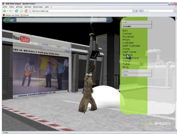
Figure 3: Web based navigator embedding modeling tools, and providing a mapping of web pages as interactive textures.

3D rendering engine. Its robustness, efficiency, upgradability and openness are, in fact, essential features for a durable system. Moreover, Ogre 3D can be easily embedded in web pages thanks to a Mozilla or ActiveX plugin. Conversely, web pages can be mapped on 3D models as interactive textures thanks to the Navi library based on Gecko. Thus, the navigator allows a Web 2.0 navigation inside the Web 3D, as well as a Web 3D navigation inside the Web 2.0. Our view is, in fact, that Web 3D and Web 2.0 should integrate each other (see figure 3). Since the virtual universe belongs to all users, modeling tools are embedded within the navigator in order to create, modify or delete contents. At the moment, we focus on intuitive tools, but procedural, declarative, parametric and sketch-based modeling tools are obviously considered. Finally, to provide access to the virtual universe on mobile devices, nodes can be hosted by proxy servers, to reduce the amount of computation that has to be performed on terminals with scarce resources. Thus, hosts can compute collision detection, physics animation, data-exchange management, and viewpoint-based filtering, and then communicate with the navigator that only needs to render the virtual environment and interact with it (see figure 2).