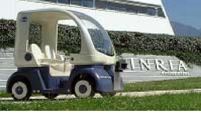
Fig. 2. The Cycab Platform.

tracking algorithm is proposed. A simple and naive clustering algorithm is used to extract objects from the BOF grid. By taking the prediction result of the tracking module as a form of feedback to the clustering module, the clustering algorithm avoids searching in the entire grid which guarantees the performance. A re-clustering and merging strategy is employed only when the ambiguous data association occurs. The computational cost of this approach is linear to the number of dynamic objects detected, so as to be suitable for scenes in cluttered environment. Our approach has been tested on the real data collected on real cars in highway and cluttered urban environments (Fig. 1), and also on our Cycab experimental platform (Fig. 2).