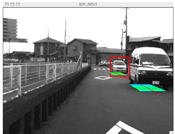
Fig. 1. Example of BOF output using a computer vision car detector as input (red boxes): The images are provided by a camera mounted on the moving ego-vehicle. The BOF output is projected back on the image. It represents a grid of occupancy probability (blue-to-red mapped color) and the mean velocity (red arrows) estimates.

multiple sensors could provide more reliable and robust information of the environment. However, in traditional multiple sensor fusion techniques, data association problem could be further complicated. The associations between the two consecutive time instances from the same sensor as well as the associations among the tracks of different sensors will have to be take into account at the same time. Fortunately, these difficulties do not exist in the grid based approaches [6] which deal with the data association problems in a more feasible way. Uncertainties of multiple sensors are specified in the sensor models and are fused into the BOF grid naturally with solid mathematical ground.