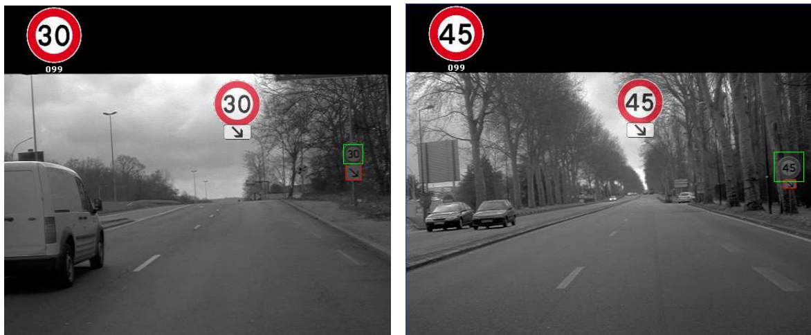
Fig. 4. Illustration of correct detection and recognition of square and big (left) as well as rectangular and small (right) French exit-lane supplementary signs