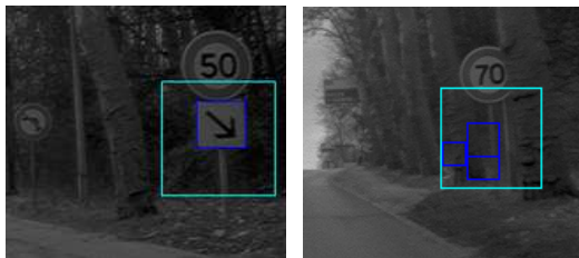
Fig. 3. Illustration of research zone below recognized speed-limit signs, and of rectangle-detection inside: on the left, a supplementary sign is detected, on the right spurious rectangles are detected but shall be eliminated by recognition step

As a first test, we focused on French exit-lane supplementary signs, which exist in various “flavours”, some of them square, and others with rectangular shape. We decided that the most convenient way to deal with that was to systematically resize the potential supplementary sign to a common (experimentally chosen) 12x12 square size. The classifier itself is a MLP neural network with 12 \times 12 = 144 inputs, and only 1 output neurons designed to output +1 for all positive examples of exit-lane supplementary signs and -1 for any other image. The hidden layer size was set to 10 neurons, by comparing, on validation set, correct classification rates for several hidden layer sizes. A first evaluation was done on a set of recorded French videos containing 50 speed-limit signs, among which 18 with an exit-lane supplementary sign below. The results obtained are illustrated on figure 4, and quantified in table 2. The correct detection rate of 78% is already quite satisfactory for a first implementation, and further improvement to increase precision by collecting more negative examples is underway.