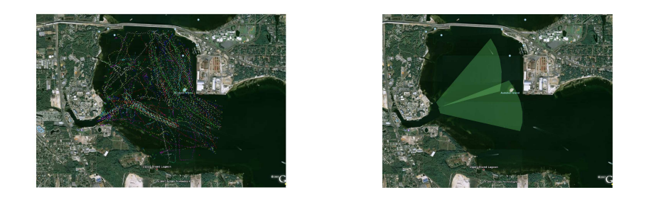
Fig. 5. Unsupervised Sensor Alignment: (Left) Color coded RADAR tracks at a port. (Right) The field-of-views of two high resolution cameras obtained using the proposed approach.

thorities), RADAR bearing and distance observations of targets at a port, and vehicles and people with RFID tags [6]. Multi-sensor alignment with overlapping fields of view using target observations is another example of unsupervised sensor alignment [11]. For our experiments, we used RADAR information to calibrate hi-resolution cameras installed at the port. Fig. 5 (left) shows the color-coded RADAR tracks. The field-of-views of cameras estimated using the proposed alignment approach is shown on the right. As with semi-supervised alignment, the maximum error is around 15 meters at a distance of 1500 meters from the cameras. Figure 6 shows an alignment of two visual sensors obtained by the proposed approach based on their target observations during a time span of 5 minutes. The estimated homography is consistent with the one reported in [11] using target observations from hour-long clips of the same video sequences as well as the manually obtained results by visually matching feature points in both the images.