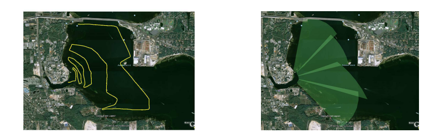
Fig. 3. Semi-supervised Sensor Alignment: (Left) A typical GPS track designed to be horizontal for better alignment. (Right) The field-of-views of four cameras obtained using the proposed approach at a port.