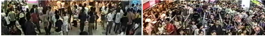
Fig. 3. Two extremely crowded real-world scenes include a railway station concourse (left) and ticket gate (right). The top half of the original frames are excluded from modeling, as they only contain views of the station ceiling.