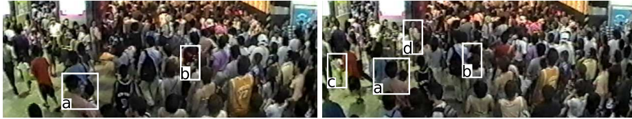
Fig. 1. Two frames from an extremely crowded scene that pose significant problems including appearance variations (a), frequent occlusions (b), and concurrent, independent activities (c) and (d). We derive a novel computational framework that models the temporal statistical behavior of local spatio-temporal motion patterns to analyze such videos.

motion patterns within local areas of the entire sequence, modeling the underlying intrinsic structure they form in the video. In other words, we model the motion variation in local space-time volumes and their temporal statistical behaviors that characterize the scene. Our construction is unique in that it captures the large motion pattern variations in the video sequence while maintaining a robust representation of the motion in local video regions. To capture the typical motion behaviors of the scene, we derive a distribution-based HMM that retains the rich motion information within our local spatio-temporal motion pattern representation and describes natural motion transitions within a local video region. We use this to model the stationary structure of motion patterns in the video, i.e. usual events within the scene, and identify atypical events as statistical anomalies.