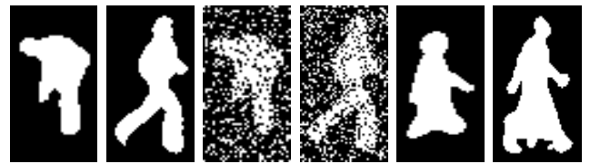
Figure 3. Sample real-world silhouettes of: ‘bend’ and ‘run’ actions from WRWHA data (left), corrupted images by adding \alpha = 40\% ‘salt and pepper’ noise (middle); ‘occluded legs’ and ‘walk a dog’ actions from the ‘robustness’ data used (right).

In this section we use a real-world data-set used by Gorelick et al. [3] which is also available at www.wisdom.weizmann.ac.il/~vision/SpaceTimeActions.html . We refer to their method as the TPAMI07 method and to the Weizmann real-world human action data as the WRWHA data. Recently, Wang and Suter [9] have also used this data-set to evaluate their method that is referred to here as the TIP07 method. The WRWHA data-set contains the foreground masks of n_S = 90 video samples corresponding to n_C = 10 actions performed by n_A = 9 actors providing a variety of male and female body shapes. These actions are: C1) ‘bend’, C2) ‘jack’ (jumping jack), C3) ‘jump’, C4) ‘pjump’ (jump on the same spot on two legs), C5) ‘run’, C6) ‘side’ (galloping sideways), C7) ‘skip’, C8) ‘walk’, C9) ‘wave1’ (wave one hand), and C10) ‘wave2’ (wave two hands). The video frame size used is 180 \times 144 at the frame rate 25 fps. We show sample original images of actions ‘bend’ (C1) and ‘run’ (C5) in the left-hand side of Fig. 3.