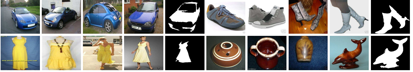
Figure 2. Examples for the four classes of the Ebay data set: blue cars, grey shoes, yellow dresses, and brown pottery. For all images masks with the area corresponding to the color name are hand segmented. One example segmentation per category is given.

Ebay color name set: To test the color names a human-labelled set of object images is required. We used images from the auction website Ebay. Users labelled their objects with a description of the object in text, often including a color name. We selected four categories of objects: cars, shoes, dresses, and pottery (see Fig. 2). Of each object category 110 images were collected, 10 for each color name. The images contain several challenges: the reflection properties of the objects differ from matt reflection of dresses to highly specular surfaces of cars and pottery. Furthermore, it comprises both indoor and outdoor scenes. For all images we hand-segmented the object areas which correspond to the color name. In the remainder of the article when referring to Ebay images, only the hand segmented part of the images is meant, and the background is discarded.