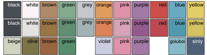
Figure 4. First row: prototypes of the 11 basic color terms based on chip-based color naming. Second row: prototypes of the 11 basic color terms learned from Google images based on PLSA-bg. Third row shows results on a varied set of basic color terms (left and middle group): prototypes of several of the color names learned from Google images using 14 color names: the 11 basic color terms extended with beige, olive and violet. Third row (group to the right): prototypes of the two Russian blues learned from Google images.

As a second example of flexibility we look into inter-