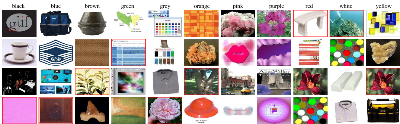
Figure 1. Google-retrieved examples for color names. The red bounding boxes indicate false positive images. The same images can be retrieved with various color names, such as the flower image which appears in the red and the yellow set.

tage of chip-based color naming is its inflexibility with respect to changes of the used color name set. This is caused by the demanding experimental setup necessary for chip-based color naming. Changing the set by adding for example beige, violet or olive, would imply rerunning the experiment for all patches.