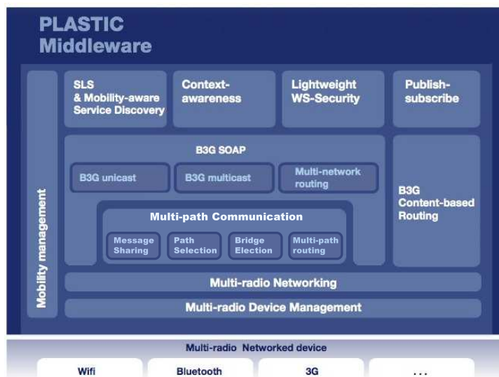
Fig. 3. Multi-path Communication Layer on PLASTIC Middleware

the position of the Multi-path Communication layer in the PLASTIC Middleware architecture. This layer uses functionalities provided by the Multi-radio Networking layer such as the ability to send packets through different interfaces or to resolve a PLASTIC Address into its corresponding set of valid IP addresses. The Multi-path Communication layer, however, is optional: whenever a SOAP message must be sent through a single path, the B3G SOAP layer can dispatch it directly to the Multi-radio Networking layer.