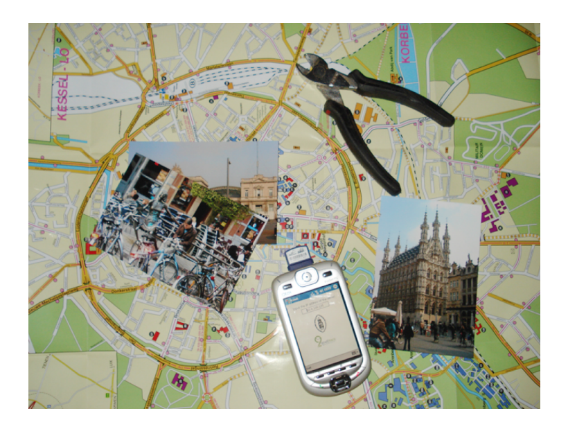
Fig. 4. The cultural tourism scenario

The goal of our setup is to find a secret agent who disappeared somewhere in the park, based on several belongings (Things) of the agent that were recovered (see Fig. 4). The Things at hand are: a pair of pliers, some pictures, a map and a PDA equipped with an RFID reader and our application. Obviously, many approaches can be taken to find leads to the secret agent. In the following paragraphs, we give an example of how this could be done.