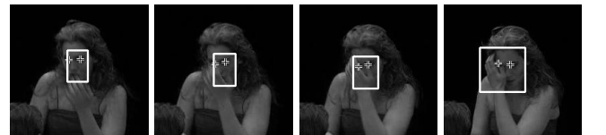
Fig. 3. Results of the tracking process in case of occlusion of the face by the hand.