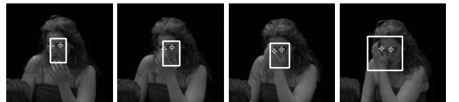
Fig. 3. Results of the tracking process in case of occlusion of the face by the hand.