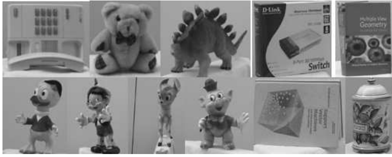
Figure 1. The 11 objects of our dataset. (From top left: tele, teddy, dino, box, book1, duck, pino, bambi, tommy, book2, biscuits).

and as a consequence avoids redundancies in the vocabulary. The filtering methods consist in modeling the dynamic system to be tracked by a hidden Markov process. The goal is to estimate the values of the state \mathbf{x}_k from observations \mathbf{z}_k obtained at each instant. The system is described by a dynamic equation modeling the evolution of the state and a measurement model that links the observation to the state. The unknown state is \mathbf{x}_k = \{\mathbf{p}_k, \mathbf{s}_k, \mathbf{d}_k\} , where \mathbf{p}_k is the location of the SIFT, \mathbf{s}_k its scale and \mathbf{d}_k its main direction. The final system consists in: