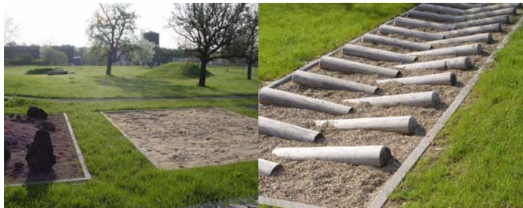
Fig. 4. The rover test area of University Würzburg

Depending on conditions of the particular test area like roughness, traction and inclination, the configuration of the basic drive assistance and the composition of autonomous reactions were adapted. All tests were accomplished