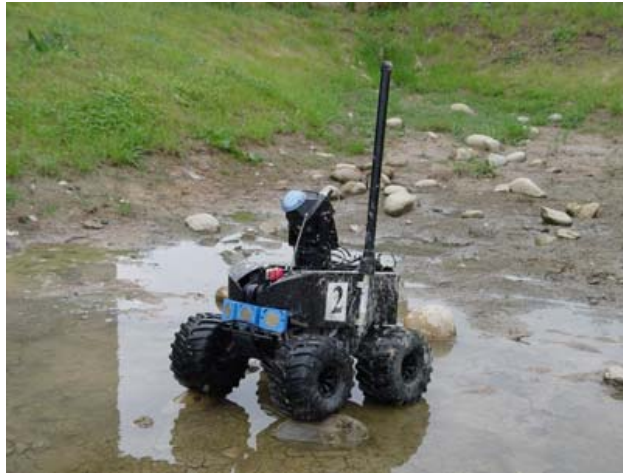
Fig. 1. The Outdoor MERLIN in drive configuration during the test at the European Land Robotics trial ELROB 2005.

The design requirements relate to a payload mass of about 5 kg at a total rover mass of max 20 kg, a maximum velocity of 40 km/h (on road), an operational period of 1 hour, and robust performance in harsh outdoor environments.