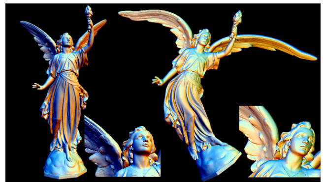
Figure 2: The interactive smooth deformation of this model (28M triangles) has been done in less than 5 minutes, including pre and post streaming process, with our system.