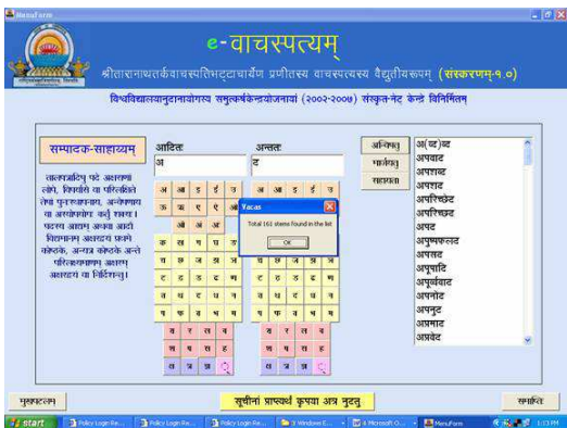
Figure 4: Editor's help