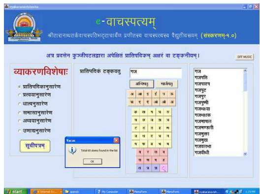
Figure 7: Grammatical Specialities-3