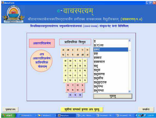
Figure 2: Alphabetical-index