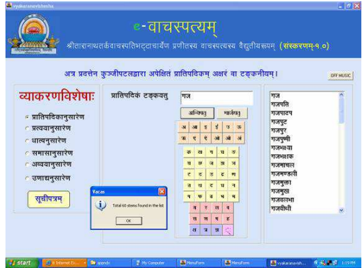
Figure 6: Grammatical Specialities-2