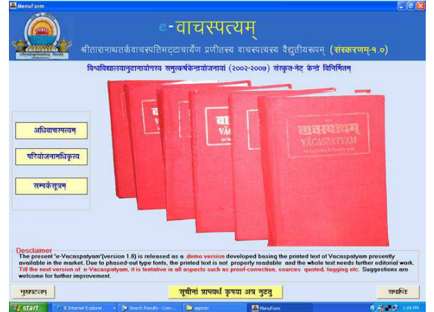
Figure 1: Home page of Vacaspatyam