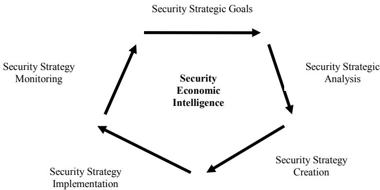
Figure 1: Phases for the development of a national security strategy

We do not intend to study how use the security economic intelligence in developing a security strategy for a nation or its organizations, as this is beyond the scope of this paper, we emphasize the fact that this new concept is at the core of any national security strategy, and it also remains as a sequential supportive process for all phases of the security strategy, as show in Figure 1.