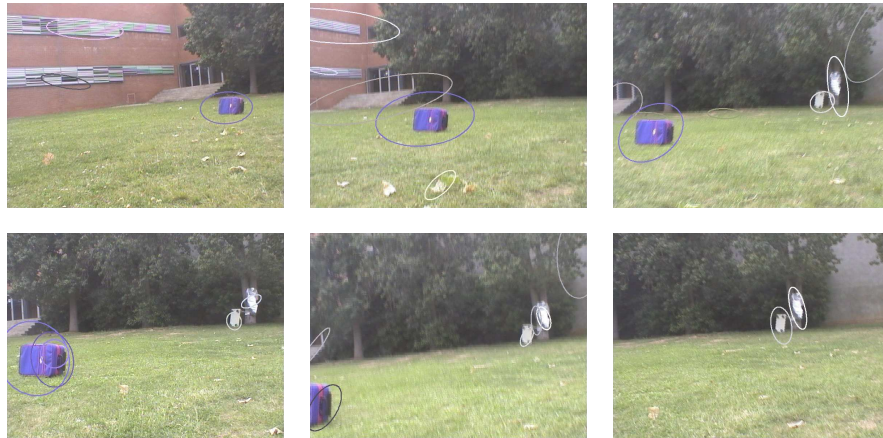
Fig. 4. Six snapshots of the navigation experiment with the robot Lauron III .

Fig. 4 shows some snapshots of a preliminary test of the use of the salience detector for the guidance of a robot outdoors. The legged robot Lauron III is facing the situation shown in frame 1, in which the blue bag is chosen as initial navigation target. After some progress towards it (frame 2), two bright objects enter the field of view and are identified as salient landmarks by the system (frame 3). One of these objects is selected as a new target and the robot proceeds towards it letting the old target back (frames 4-6).