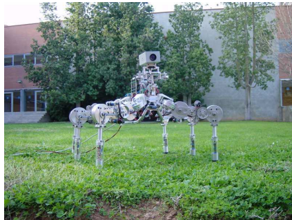
Fig. 2. The six-legged robot Lauron III used in the experiments.

the bumpers or a null advance of the robot in response of a movement command are interpreted as obstacles. In the legged robot, the activation above a threshold of the front infrared sensor, the collision with one leg at a given height, or the impossibility to find a stable support, are all considered as obstacles. Both robots also consider very close landmarks as obstacles.