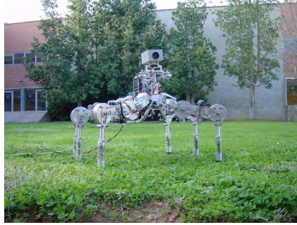
Fig. 2. The six-legged robot Lauron III used in the experiments.

the bumpers or a null advance of the robot in response of a movement command are interpreted as obstacles. In the legged robot, the activation above a threshold of the front infrared sensor, the collision with one leg at a given height, or the impossibility to find a stable support, are all considered as obstacles. Both robots also consider very close landmarks as obstacles.