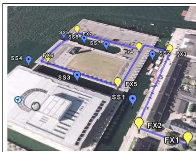
Figure 2. Copenhagen Channel Soundscape

We choose to develop an innovative immersive music application on mobile phones. 3D spatialized sound sources positioned with the help of a geographical information