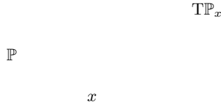
Figure 1: The tangent flat to \mathbb{P} at x is a line. Note that a polyhedron may have smaller-dimensional parts. Points that sample lower-dimensional parts can have a high-complexity Delaunay triangulation but still not damage the overall complexity, because they form a small subset of the set of sample points.

in \mathbb{P} . Formally, writing \Pi(z) for the set of points in \mathbb{P} with minimum distance to z \in \mathbb{R}^d , we have