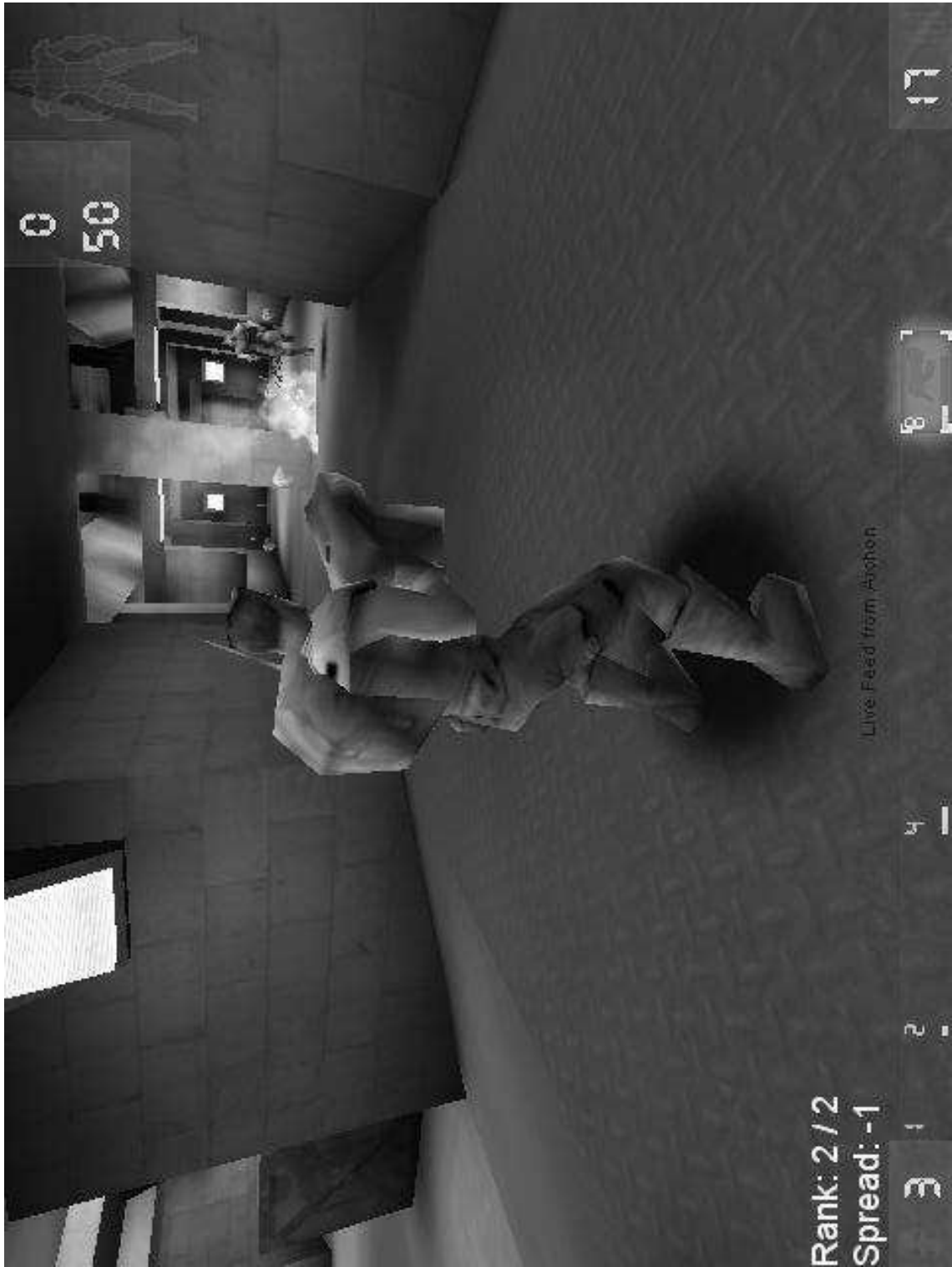
Fig. 1. Unreal Tournament and the Gamebots environment.