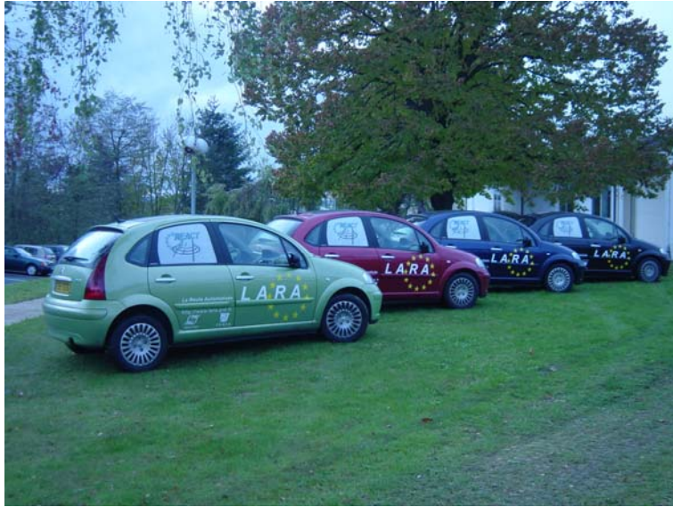
Figure 2. REACT sensor vehicles: 4 LaRA C3.

Several tests will take place. WiFi is being tested to choose the hardware. Then VSC tests will validate the VSC basic functionality (formation, dynamic management...). A third step is a system test combining the VSC capabilities with the Regional Control Center (RCC, centralized management). A last set of experiments will prove that VSC can be deployed without a RCC. Finally a public demonstration will take place by the end of October in Paris, France. The last two sets of experiments will demonstrate that the COM2REACT system is operational and easily deployable for the next generation of traffic management systems.