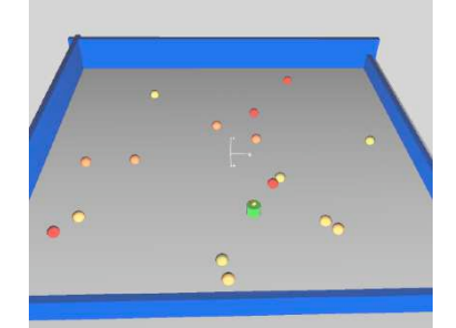
Fig. 1 . The task: a robot wanders through the environment and has to perform a given behavior in order to access resources (i.e. the yellow/red balls). The behavior to perform is a sequence of "key" movements to "open" the resources. The more complex the behavior needed to access a resource, the greater the reward (one key is enough for the yellow balls while four keys are needed to "eat" the red ball). The goal is to learn the complete sequence that makes it possible to access any resources (the agent accesses simpler resources first; performing the whole sequence gives access to any resource).

On the one hand, recent works addressed this issue either by decomposing the learning task or by endowing the agent with such capabilities that should make the goal easier to achieve [1,2]. On the other hand, literature in Evolutionary Approach shows that modifying the very nature of genetic operators and/or fitness during the course of evolution may lead to better results for complex problems [3].