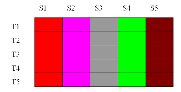
Fig. 2. Each source corresponds to a specific structure (5 sources here - corresponding to columns) - the different thematic (rows) will appear in different proportions in each source.

both the structure only (SO) classification/clustering tasks and structure and content (SC) tasks where considered, while the second year was more focused on the structure and content tasks.